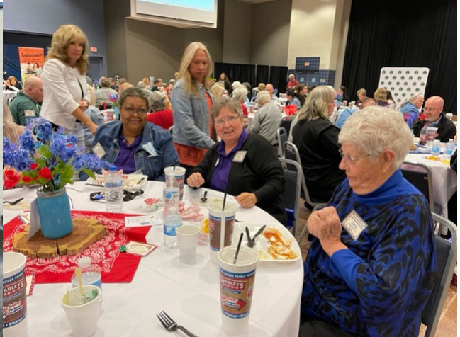
Lunch at SE District Meeting